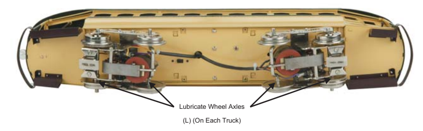
Figure 1. Lubrication Points on the Locomotive

You should lubricate the engine to prevent it from squeaking. Use light household oil and follow the lubrication points marked "L" in Fig. 1. Do not over-oil. Use only a drop or two on each pivot point.