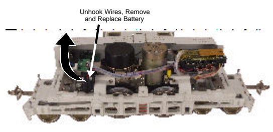
Figure 3b. Replacing the Battery