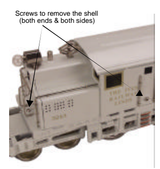
Figure 3a. Screws to Remove to access the inside of the engine.

If the sounds are not improved at the end of the 15 minute test charge, it is time to replace the battery (see directions below). Contact the M.T.H. Parts Department (phone: 410-381-2580; e-mail: parts@mth-railking.com; mail: 7020 Columbia Gateway Drive, Columbia MD 21046-1532) for a replacement battery. A standard 9v alkaline battery can be substituted until your replacement arrives, but since alkaline batteries cannot be recharged, it will eventually wear down. Do NOT use a 6-cell 7.2v battery like those found in most convenience stores.