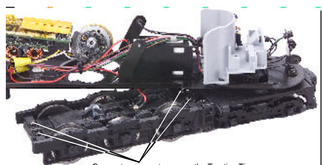
Screws to remove to access the Traction Tires Figure 8. Locations of Truckside Mounting Screws

2. Slip the new tire onto the wheel. You may find it useful to use two small flathead screwdrivers to stretch the tire over the wheel.