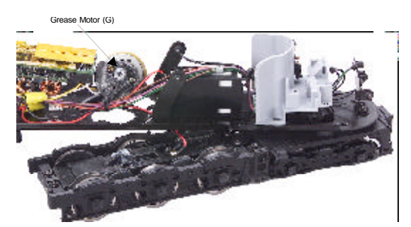
Figure 7. Greasing the Worm Gear on the Motor