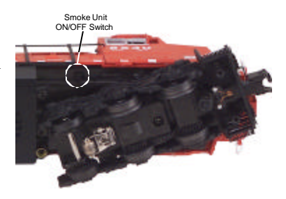
Figure 3. Smoke Unit ON/OFF Switch

When storing the unit for long periods of time, you may want to add about 15 drops of fluid to prevent the wick from drying out.