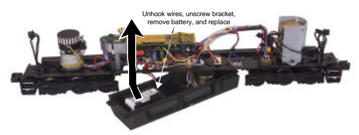
Figure 11. Replacing the Battery (Remove the remaining 2 screws on the fuel tank to access the battery.)