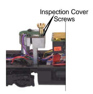
Figure 4. Inspecting the Smoke Unit

Replacement wicks are available from the M.T.H. Parts Department.