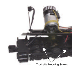
Figure 8. Truckside Mounting Screws to Access the Traction Tires