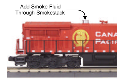
Figure 2. Add Smoke through the Smokestack

When the smoke output while running the engine begins to diminish, add another 10-15 drops of smoke fluid or turn the smoke unit off.