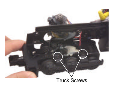
Figure 4. Screws to Remove to Access the Traction Tires

B. Remove the trucks from the chassis and the truck sides from the trucks in order to slip the new tire over the grooved drive wheel. See Fig. 4 for which screws you must remove to do this.