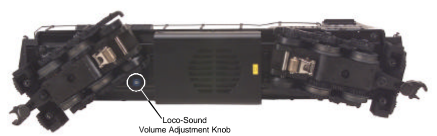
Figure 1. Location of the Loco-Sound Volume Adjustment Knob

Manual Volume Control – To adjust the volume of all sounds made by this engine, turn the master volume control knob located under the engine clockwise to increase the volume and counter-clockwise to decrease the volume (see Fig. 1).