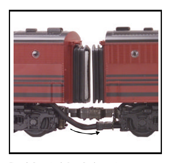
Figure 2: Connecting the Proto-Coupler extension

Before you operate your PA B Unit with the RailKing PA AA set see figure 2 for connecting the Proto-Coupler wiring harness.