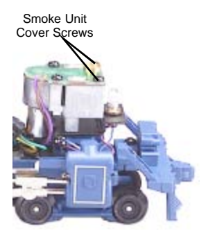
Figure 6. Smoke Unit Inspection Cover