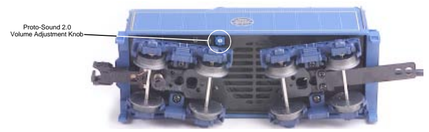
Figure 1. Loco-Sound Volume Adjustment Knob

Volume Control – To adjust the volume of all sounds made by this engine, turn the master volume control knob located under the tender clockwise to increase the volume and counter-clockwise to decrease the volume (see Fig. 1).