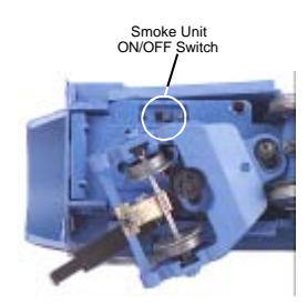
Figure 5. Smoke Switch