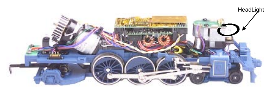
Figure 7. Replacing the Headlight and the Fire Box

You can obtain replacement bulbs directly from the M.T.H. Parts Department.