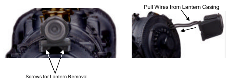
Figure 8. Replacing the Lantern Light on the Front of the Boiler