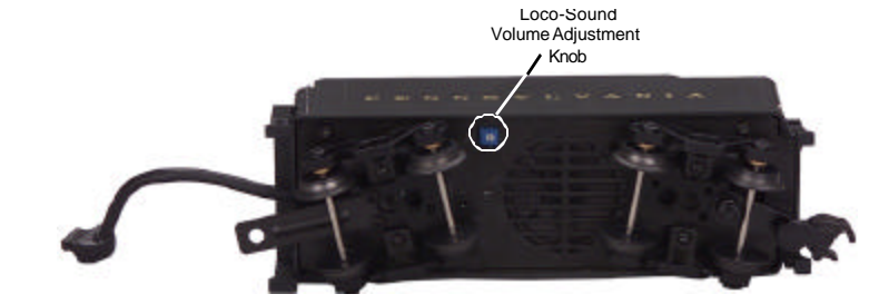
Figure 1. Loco-Sound Volume Adjustment Knob

Volume Control – To adjust the volume of all sounds made by this engine, turn the master volume control knob located under the tender clockwise to increase the volume and counter-clockwise to decrease the volume (see Fig. 1).