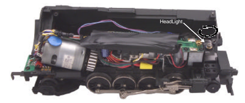
Figure 7. Replacing the Headlight

You can obtain replacement bulbs directly from the M.T.H. Parts Department.