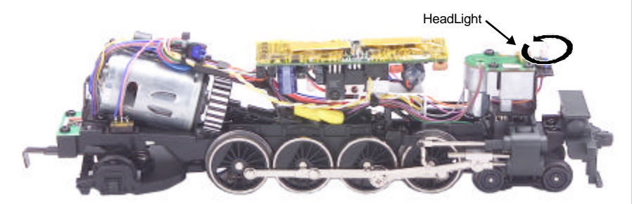
Figure 7. Replacing the Headlight

You can obtain replacement bulbs directly from the M.T.H. Parts Department.