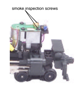
Figure 6. Smoke Unit Inspection Cover

If you experience poor or no smoke output when the smoke unit is on and has fluid, check the wick to see if it has become hard, blackened, and unabsorbent around the heating element. Remove