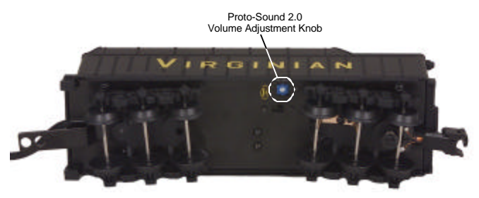
Figure 1. Proto-Sound 2.0 Volume Adjustment Knob

Manual Volume Control – To adjust the volume of all sounds made by this engine, turn the master volume control knob located under the tender clockwise to increase the volume and counter-clockwise to decrease the volume (see Fig. 1).