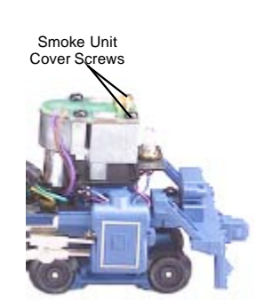
Figure 6. Smoke Unit Inspection Cover