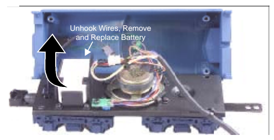
Figure 9. Replacing the Battery