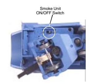
Figure 5. Smoke Switch