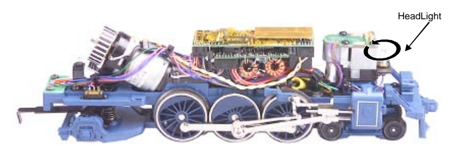
Figure 7. Replacing the Headlight and the Fire Box Light

You can obtain replacement bulbs directly from the M.T.H. Parts Department.