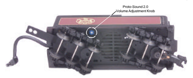
Figure 1. Adjusting the Proto-Sound 2.0 Volume Level

Volume Control – To adjust the volume of all sounds made by this engine, turn the master volume control knob located under the engine clockwise to increase the volume and counter-clockwise to decrease the volume (see Fig. 1).