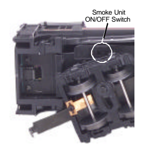
Figure 5. Smoke Switch