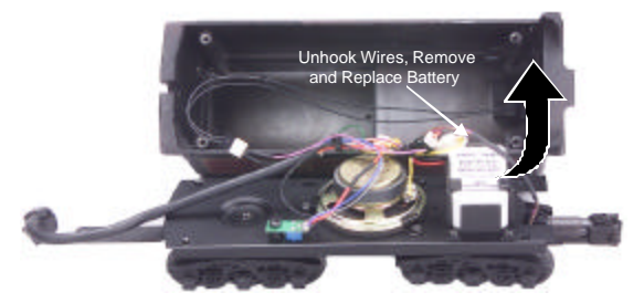
Figure 9. Replacing the Battery