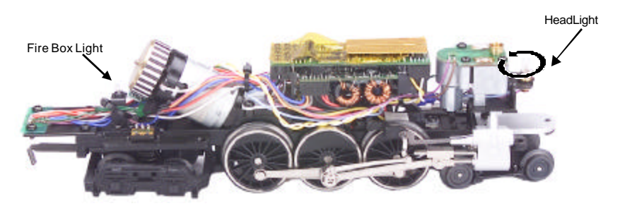
Figure 7. Replacing the Headlight and the Fire Box Light

You can obtain replacement bulbs directly from the M.T.H. Parts Department.